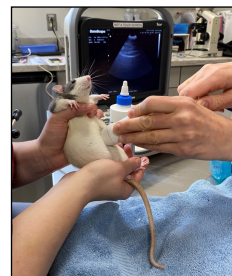
Social Media Star