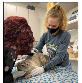
Community Pet Clinic