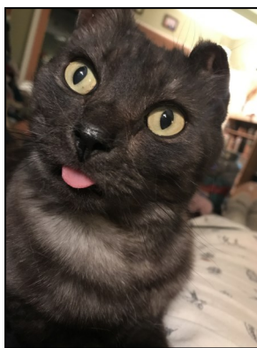
Judges' Pick: Mister Jackpots