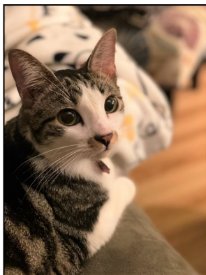
People's Choice: Jäger