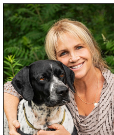
Message from our CEO