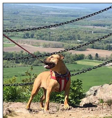
Hiking Mount Philo